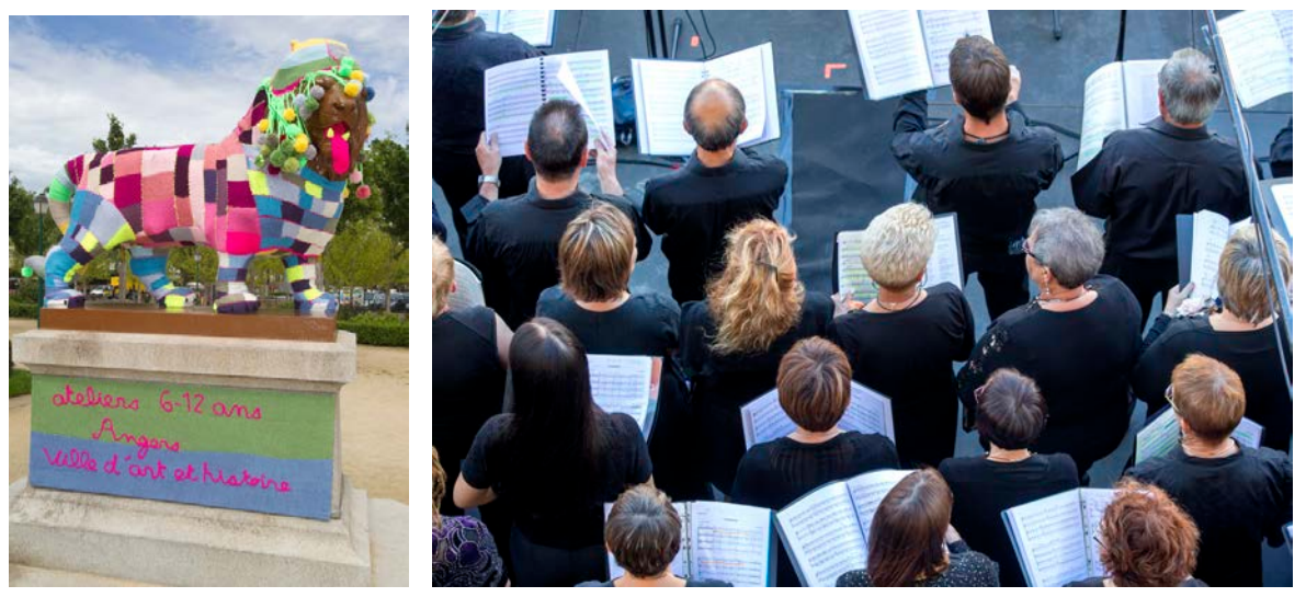
Cellograff at the Garden Promenade

This interaction and participation combines artistic practices, creativity and human encounters and provide sources of wealth and openness for the population (especially young people), but also bring the city into the limelight.