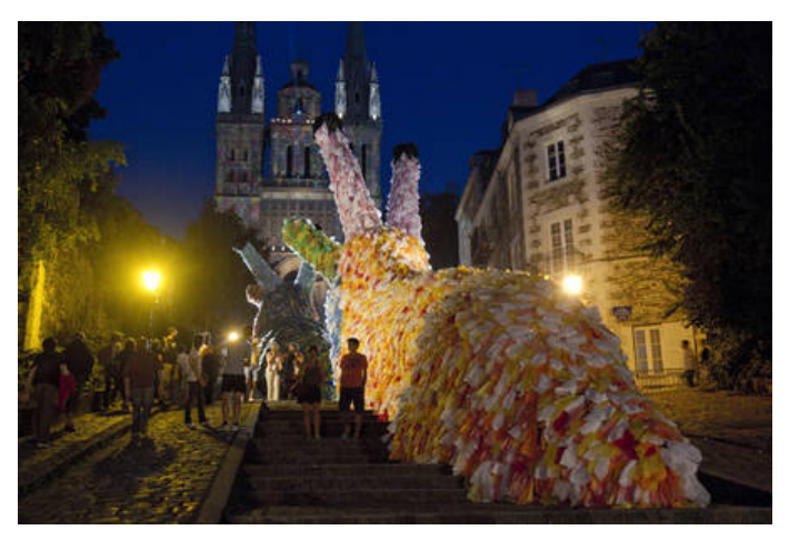
Slow Slugs - Florentijn Hofman