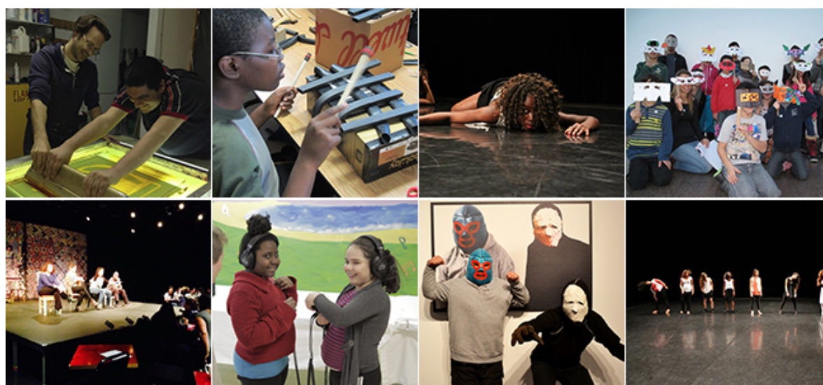
© Théâtre Aux Écuries, La Nef, Circuit-Est choregraphic centre, RIDM/Emily Gan, FIV, Exeko