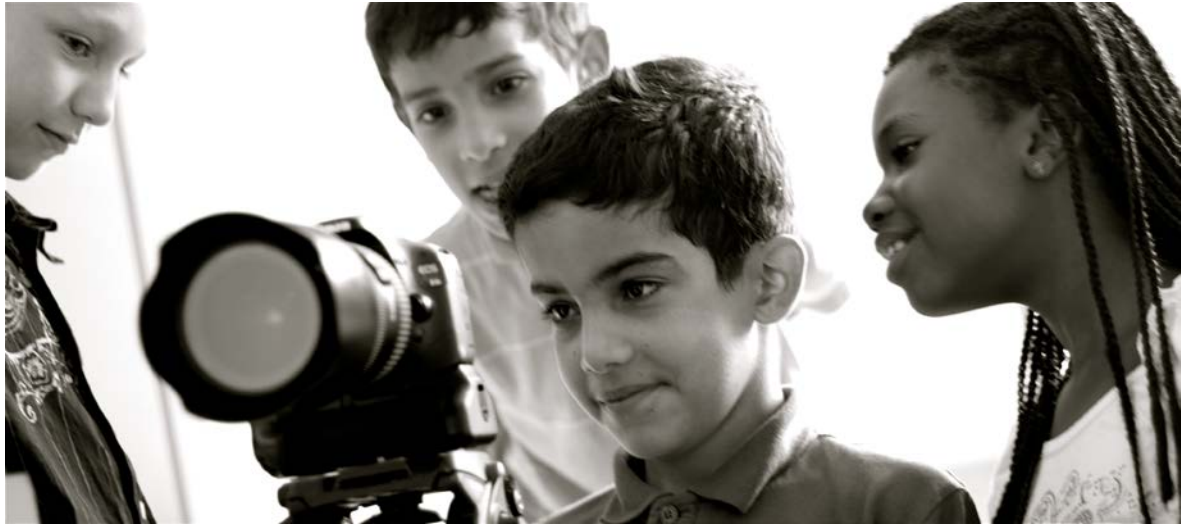
© Daphné Cyr, New Cinema Festival