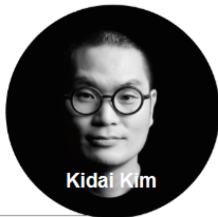
Sculptor, Space Designer