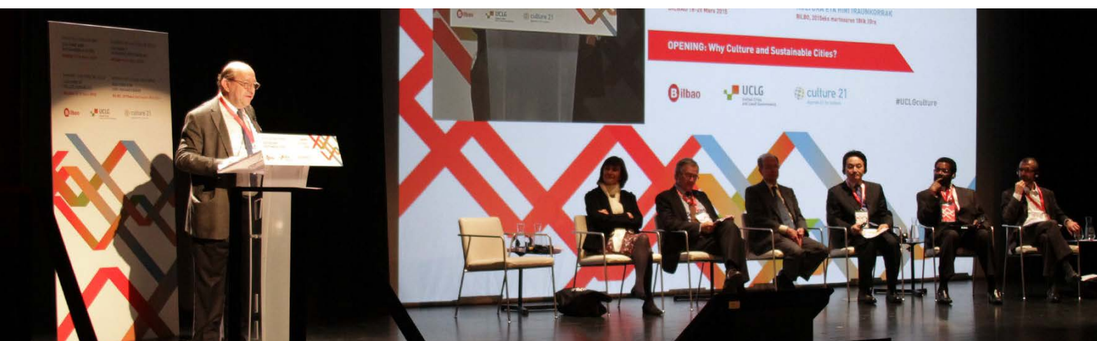
© Agenda 21 Culture – 1 st Culture Summit of UCLG in Bilbao