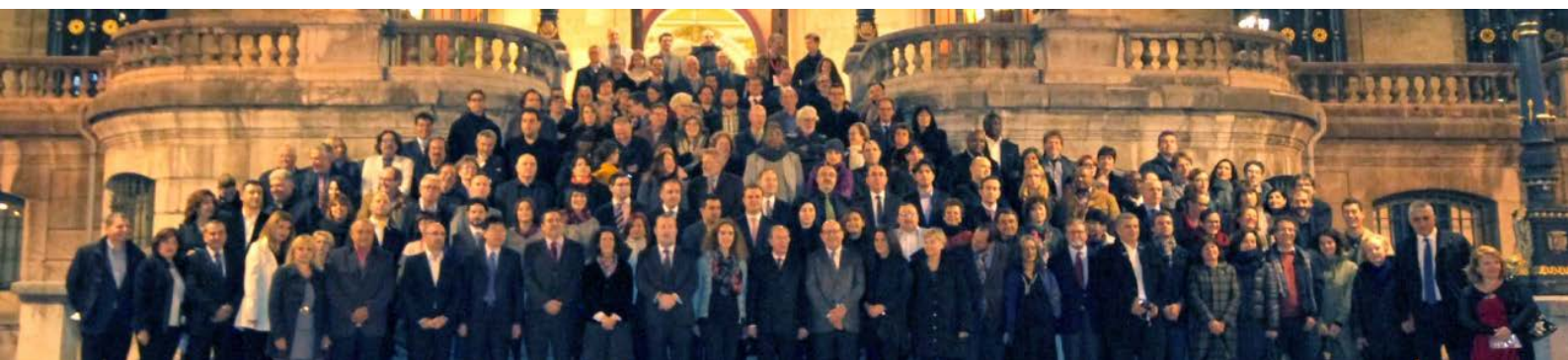
© Agenda 21 Culture – 1 st Culture Summit of UCLG in Bilbao

The 2 nd Culture Summit of UCLG is one of the Urban Thinkers Campus promoted by the World Urban Campaign of UN-Habitat.